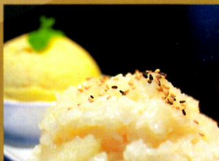
Sweet Stick Rice w. Mango Ice Cream