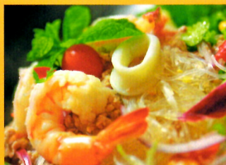
Yum Woon Sen