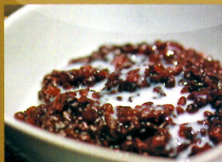
Purple Rice Pudding