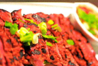
BBQ Flank Steak